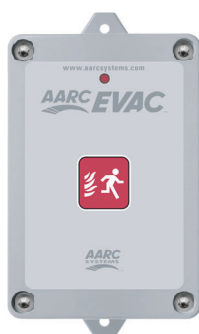
Evacuation with Hidden Cancel